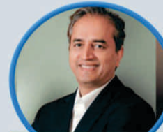
DR. DEVY SHETTY